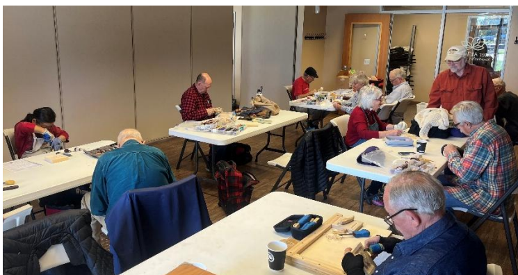
Attendees at the Senior Center session on October 21 are busy working on their kanji relief carvings.