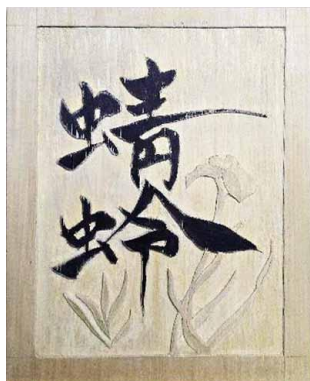
Abra Bradfield "Dragonfly"