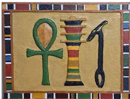
Issac Bradfield "Ankhh, Djed Pillar, and Was Scepter"

A selection of some of the relief carvings from last month's kanji project.